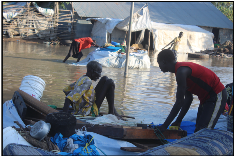
Figure 1: An elderly man being pulled to the dry grounds by a relative in downtown Bor on October 31, 2020

Recently, the author paid a short visit to Jonglei's capital, Bor Town and conducted a brief assessment on the