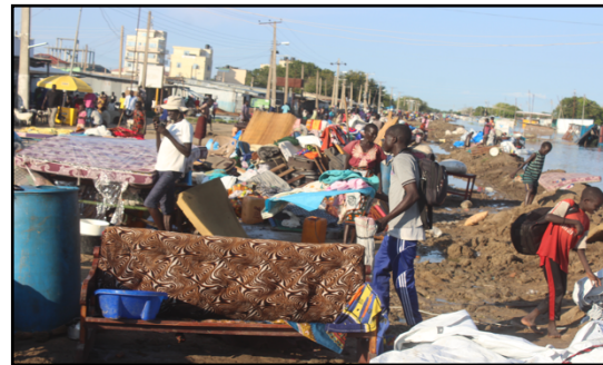
Figure 6: Section of displaced persons in Bor, October 31, 2020

Markets have severely been affected. Only Marol Market in Bor remains dry and open because it has been protected by dyke. Yet the road supply to this market has been cut off. It now only receives goods through boats from Juba. However due to high transport demand, the transport cost has gone up tremendously. In addition, the number of customers has dwindled due to a combination of displacement and loss of incomes.