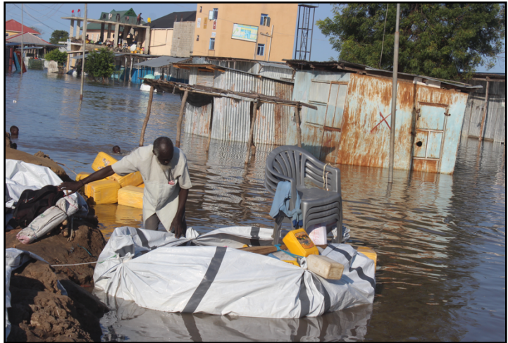
Figure 3: a displaced person pulling his belongings to dry grounds in Bor on October 31, 2020

There has been no documented baseline of the depths of flood in the town from previous floods and so these measurements are useful for monitoring and managing the flood going forward. Furthermore, we conducted interviews in the city with the displaced persons, government officials and shopkeepers in Marol Market, which is the biggest market in Bor Town and we made a number of observations, which are elaborated in the subsequent paragraphs.