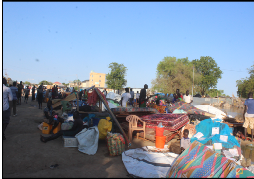
Figure 5: section of displaced persons with their belongings in Bor October 31, 2020

People and livestock have died. Infrastructure in form of roads, water and sanitation facilities,