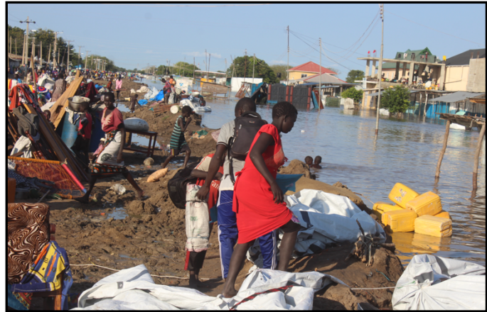
Figure 2: Displaced persons on the main street of Bor Town, October 31, 2020

This year's flood, which occurred in several devastating episodes, was triggered by heavy rainfalls caused by the Indian Ocean Dipole (IOD), a climate variability phenomenon, that saw an increase of 2 degrees Celsius in 2019. Heavy rainfalls in 2019 and 2020 led to accumulation and an unprecedented rise of water level in Lake Victoria. The water level in Lake Victoria hit 13.42 meters, a slight increase from 13.41 meters in 1964 when the Lake experienced similar water rise. IOD, and El Nino Southern Oscillation, another climate variability phenomenon, have both been exacerbated by global warming since the 1960s, causing more floods in South Sudan in the last 60 years compared to the previous 60 years.